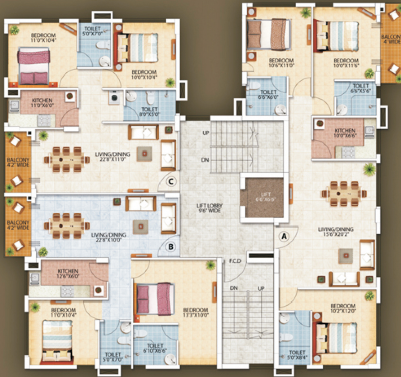
Typical Floor plan 1st to 7th Floor